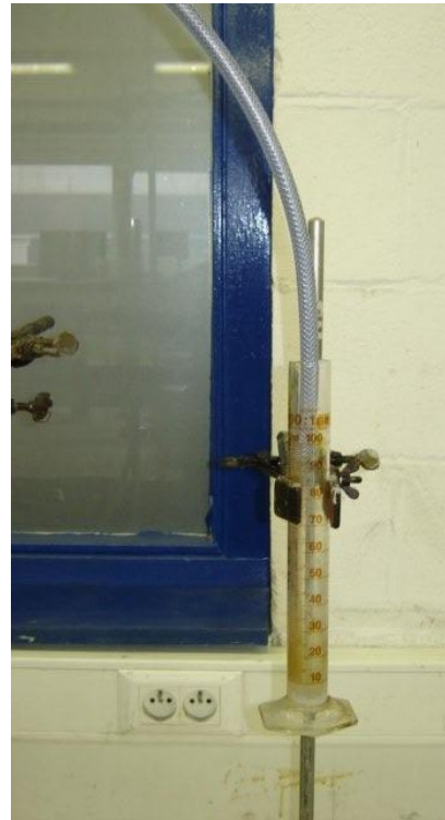
Photo 4 : The abundant amount of product is collected in a measuring cup.

The used sand has a grading between 0.7 mm and 1.25 mm. Sand of this grading is exposed to the same pressure as there would be when injecting a crack in concrete of 0.2 mm width.