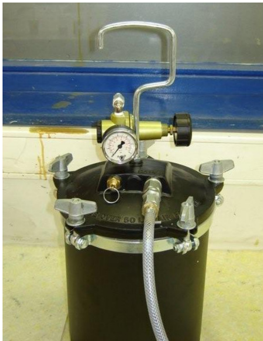
Photo 1 : Pressure vessel that pushes the product through the sand column.

Photo 1 shows the pressure vessel that pushes the product through the sand column under a constant pressure. Photo 2 shows the total test configuration before injection and before humidification. The total length of the flexible tube that supplies the product to the sand column and the sand column itself is 900 mm. The inner diameter of the flexible tube is 6 mm. The difference between the bottom of the pressure vessel and the injection column is 400 mm.