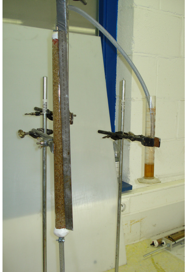
Photo 6 : Configuration at the end of the injection with PC ® Leakinject 2K Flex 6811 LV.