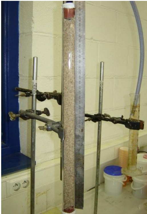
Photo 3 : At the top and at the bottom the injection column is equipped with perforated rubber plugs. Along the sand column, a measuring ruler is positioned.

By a flexible tube (length 600 mm, Ø 6 mm) the upper side of the column is connected to a measuring cup so that the abundant amount of product can be measured. The time registration stops as soon as 20 ml of abundant product is measured in this cup (photo 4).